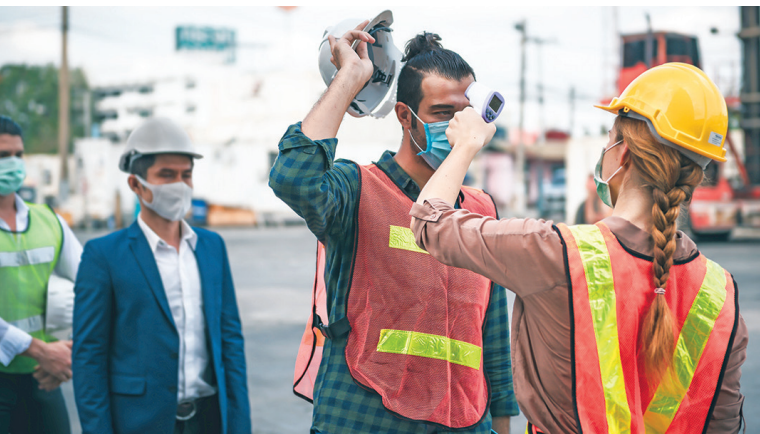
Work site safety is of utmost importance to employees, their families, and contractors.