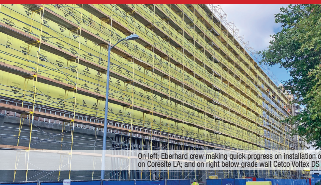
On left: Eberhard crew making quick progress on installation of DowSil Fluid Applied Air and Weather Barrier on Coresite LA; and on right below grade wall Cetco Vortex DS Waterproofing on Project Blue Sky.