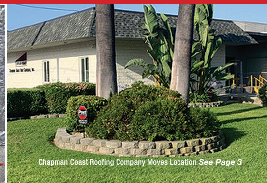
Chapman Coast Roofing Company Moves Location See Page 3