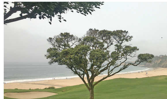
View of the Pacific Ocean from the Monarch Beach Golf Links.

On September 11, 2020, the IIBEC SoCal Chapter hosted its 18th Annual Golf Tournament at Monarch Beach Golf Links in Dana Point, CA. Despite the unprecedented challenges of 2020, the event was as enjoyable as always with the attendance of 144 golfers who made it out to enjoy the course with its coastal scenic views in perfect weather.