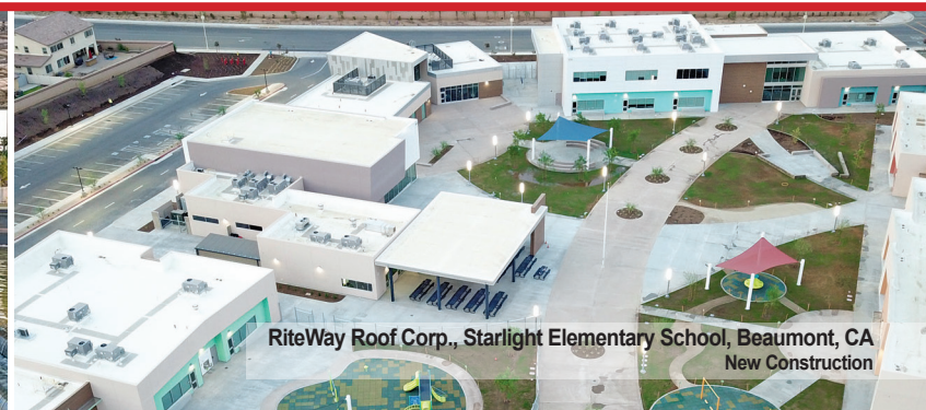
RiteWay Roof Corp., Starlight Elementary School, Beaumont, CA New Construction