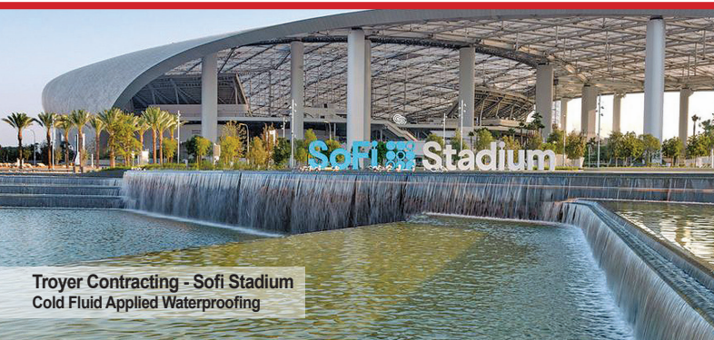
Troyer Contracting - SoFi Stadium Cold Fluid Applied Waterproofing