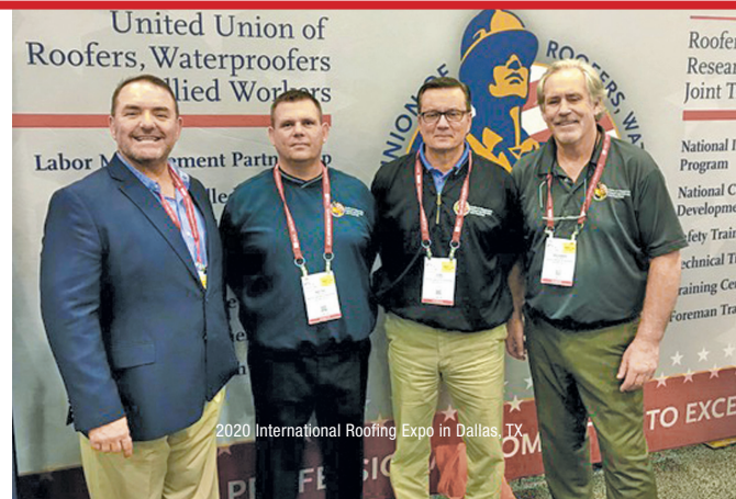
2020 International Roofing Expo in Dallas, TX