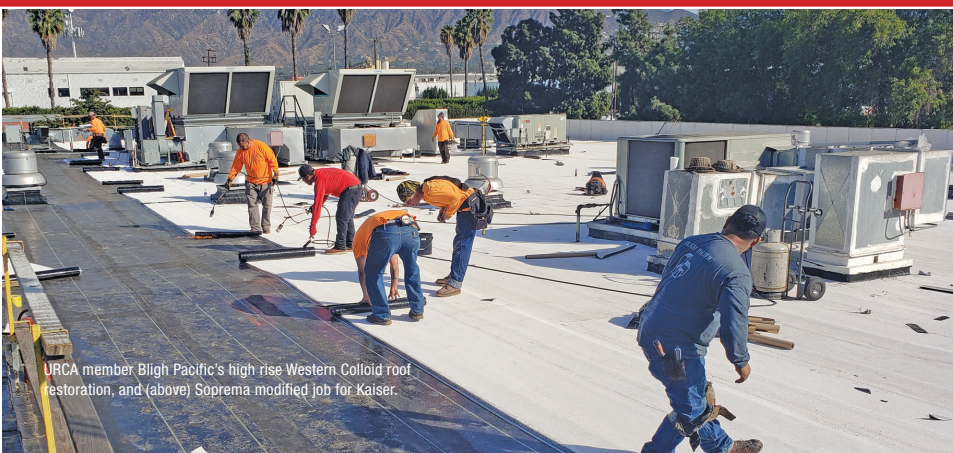
URCA member Bligh Pacific's high rise Western Colloid roof restoration, and (above) Soprema modified job for Kaiser.