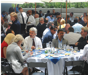
2014 Q Award post presentation luncheon at Emerson College of Los Angeles (Hollywood).