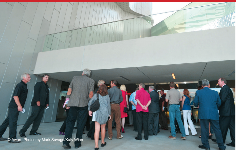
Q Award