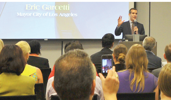
Los Angeles City Mayor Eric Garcetti addressing the capacity crowd.

In his address to the attendees, Mayor Garcetti said, "Emerson College Los Angeles is both a landmark of artistic achievement and a flagship accomplishment for the revitalization of a neighborhood that has seen decline. This is now a jewel in the crown of the Hollywood Renaissance."