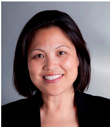
California Labor Commissioner - Julie Su

Furthermore, the Commissioner's Office reached settlements totaling over