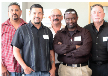
Members of Chapman Coast Roof Company at Q Award luncheon.